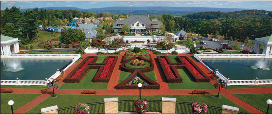
Hotel Hershey in Hershey, PA