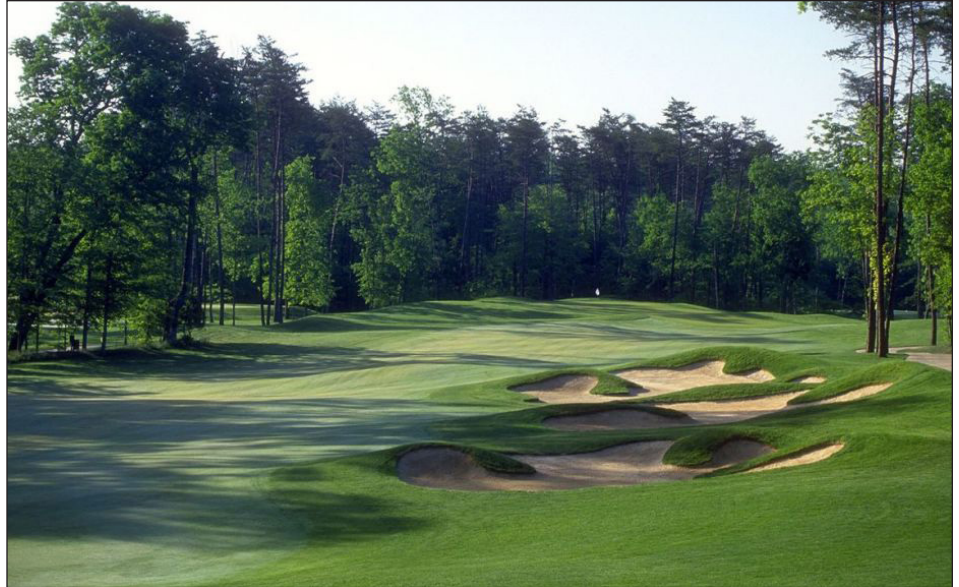
Westfields Golf Course

The Golf Committee always welcomes prize donations or those interested in assisting on the Golf Committee.