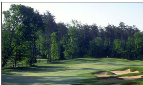
Westfields Golf Course

As always, all of the proceeds from the Tournament go straight to the FCBA Foundation to support its wonderful programs, including