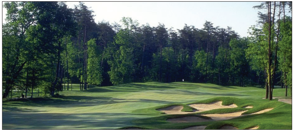
Westfields Golf Course in Clifton, Virginia

Our goal and motto: “What a great concept: Do good and have fun at the same time!”