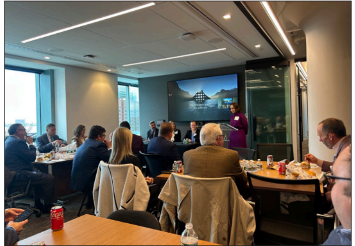
FCBA New England Chapter members and friends meet at Womble's Boston Seaport offices.