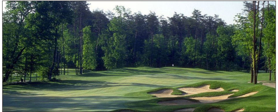
Westfields Golf Course in Clifton, Virginia

The Foundation plans to notify successful applicants regarding their scholarship awards by mid-May.