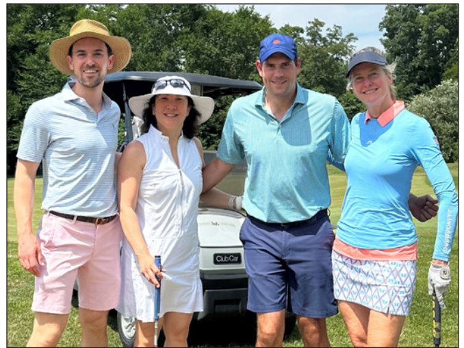
The DWT Team