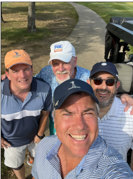
Slicers and Hookers