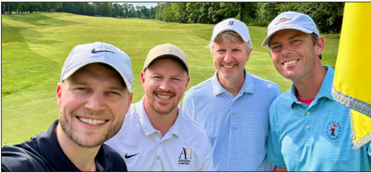
The WBK Team