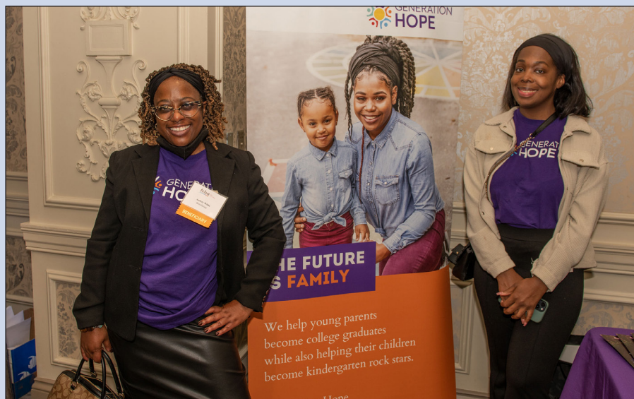
Generation Hope – The 2023 Charity Auction Beneficiary

The Auction Committee is now accepting applications from local charities to be considered as a beneficiary of the 35th Annual FCBA Charity Auction. The application should be received by the FCBA by email no later than Friday, April 5, 2024 .