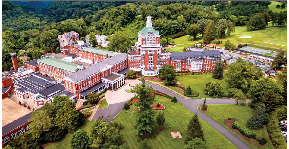
The Omni Homestead Resort

Located across more than 2,000 acres of scenic Virginia landscape, the resort