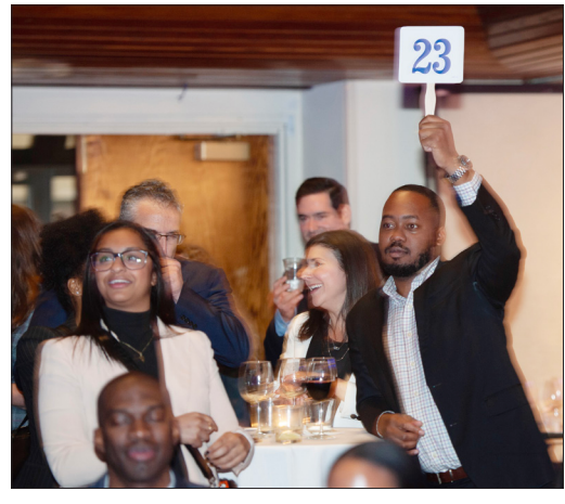
2023 FCBA Charity Auction