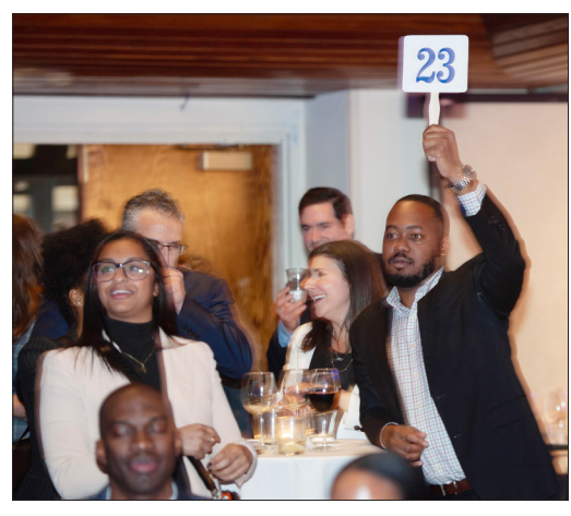
2023 FCBA Charity Auction

Generation Hope strives to ensure all young parents who are currently enrolled as students and their children have the opportunity to