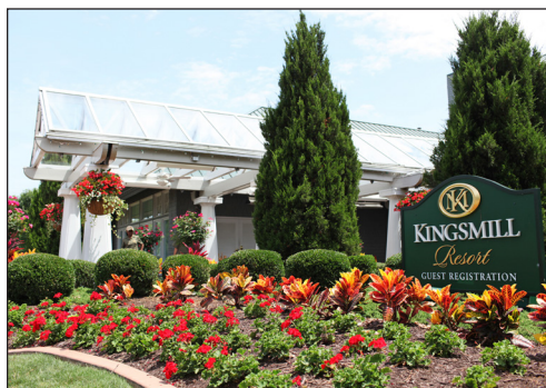
Kingsmill Resort in Williamsburg, VA