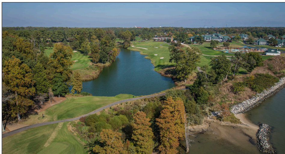
Kingsmill River Course

Kingsmill is situated on 2,900 protected acres along the James River, 150 miles from downtown Washington, DC. The resort offers many unique experiences. To learn more about Kingsmill and its many amenities and activities, go to: https://www.kingsmill.com/ .