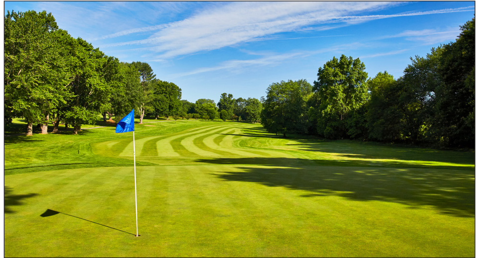
Norbeck Country Club

As always, all of the proceeds from the Tournament go straight to the FCBA Foundation to support its wonderful programs, including Scholarships and Summer Legal Internships. Over the years, the Tournament has raised over