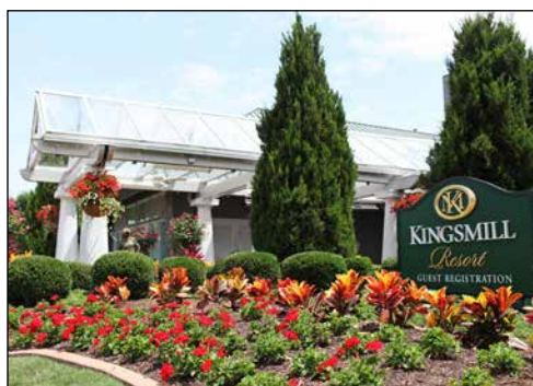
Kingsmill Resort in Williamsburg, VA