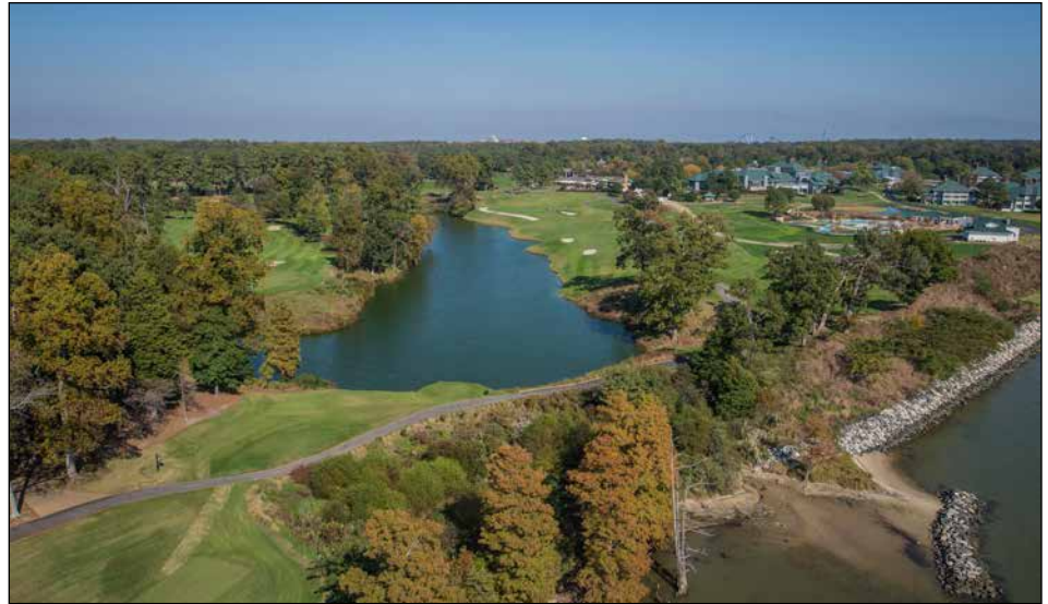
Kingsmill River River Course