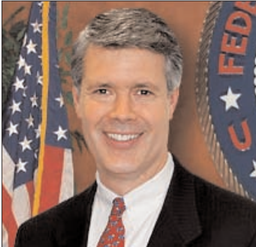
FCC Commissioner Robert M. McDowell

Newsletter of the Federal Communications Bar Association