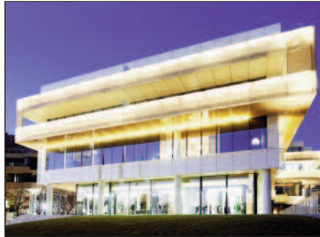
House of Sweden