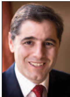
FCC Chairman Julius Genachowski

The 23rd Annual FCC Chairman's Dinner will be held Thursday, December 10, 2009 at the Washington Hilton, 1919 Connecticut Avenue, N.W. The evening will begin with a reception at 6:00 p.m. The dinner will begin at 7:30 p.m. in the International Ballroom and will be followed by remarks from FCC Chairman Julius Genachowski. Please use the registration form on page 25 to order tables or individual tickets. Sponsor's tickets include a $350.00 tax deductible donation to the FCBA Foundation.