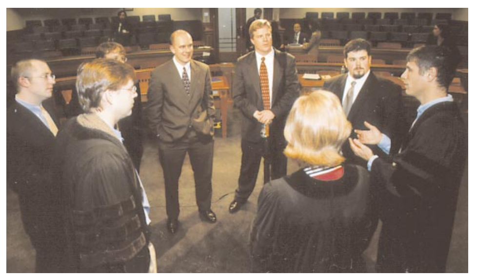
Final round judges discuss the final round argument with finalists William & Mary and University of Colorado.