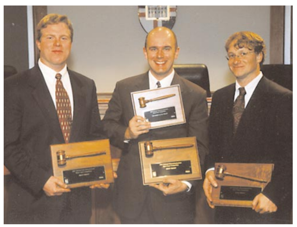
University of Colorado - Best Brief and Finalist.