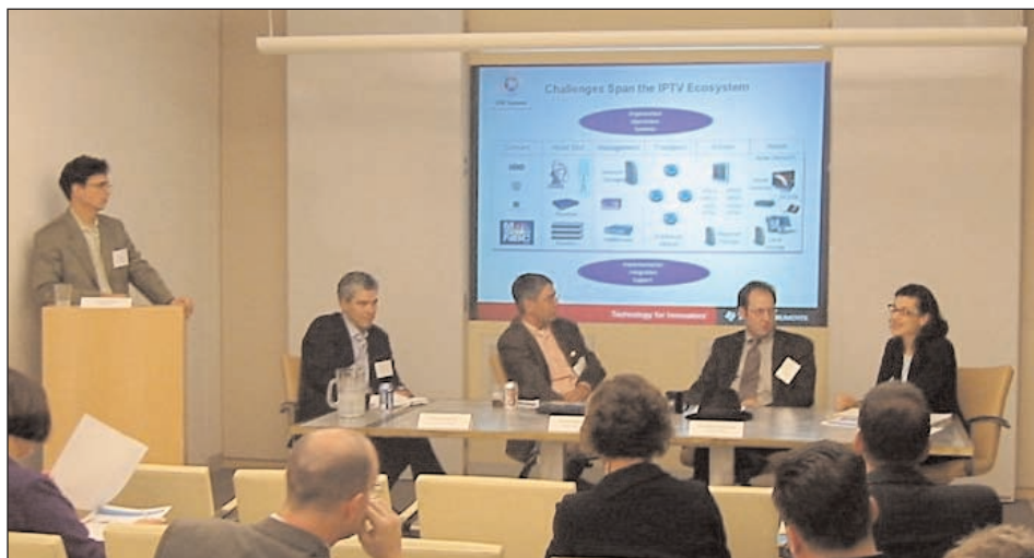
Northern California Chapter panel discussion