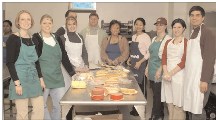
Members of the Young Lawyers Committee volunteer in two shifts at Martha's Table.