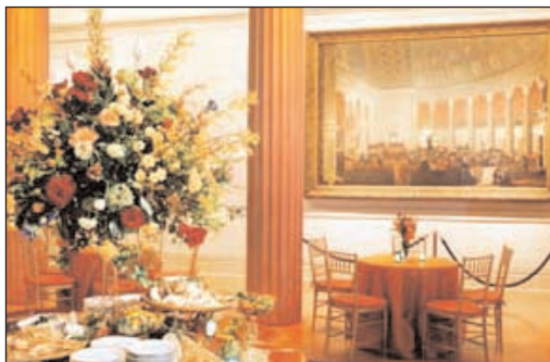
Corcoran Gallery of Art

Tickets for the reception are $45.00 for private sector members and $15.00 for