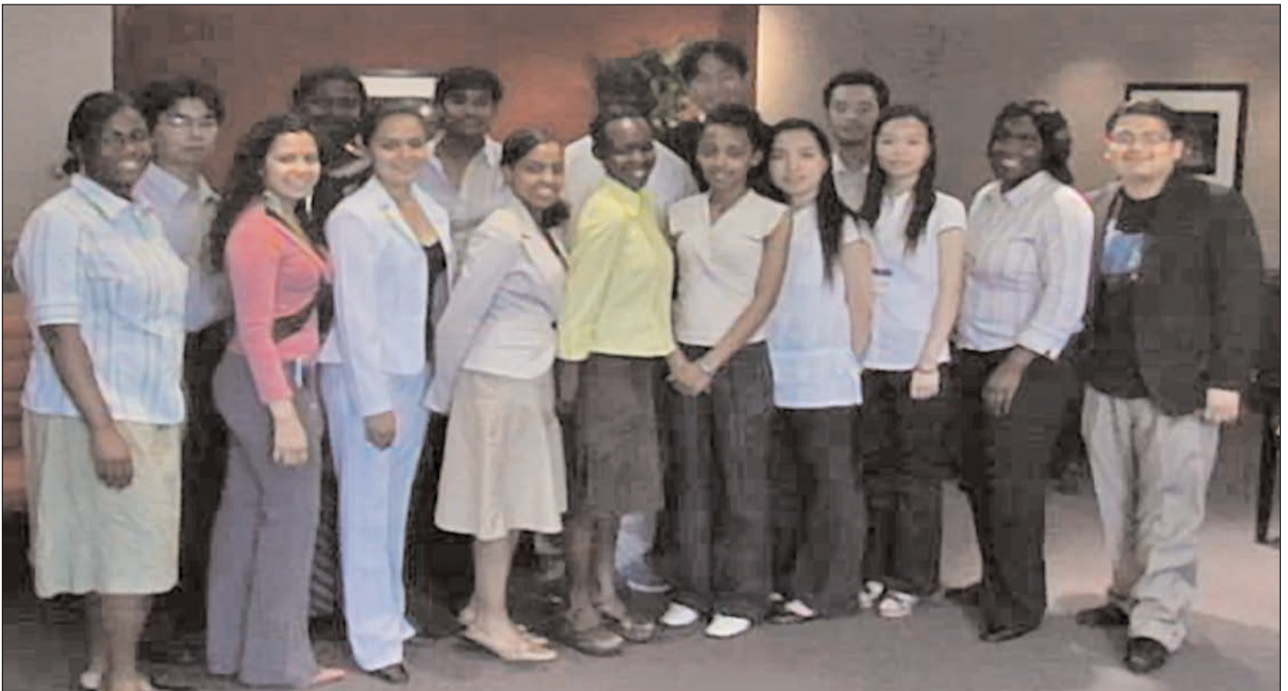
FCBA Foundation 2006 High School Scholarship Recipients