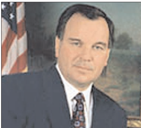
Chicago Mayor Richard M. Daley