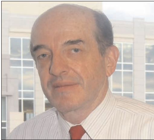
FCC Commissioner Michael J. Copps

Newsletter of the Federal Communications Bar Association