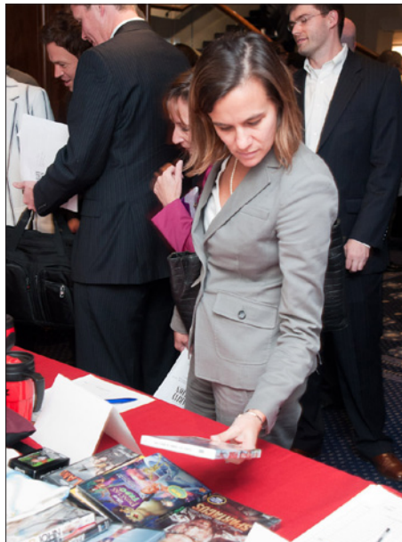
Last year's Annual Charity Auction

The Charity Auction is one of Washington, D.C.'s premier "must-attend" events for the communications industry. The event features a live auction hosted by a professional auctioneer, silent auctions, and raffle drawings. Attendees should expect surprises and new and exciting prizes building on last year's record-setting event, including vacation packages, electronics, tickets to Verizon Center events, concerts, theater shows, and various sporting events (including Redskins, Wizards, Capitals, and Nationals games), dinners, lunches,