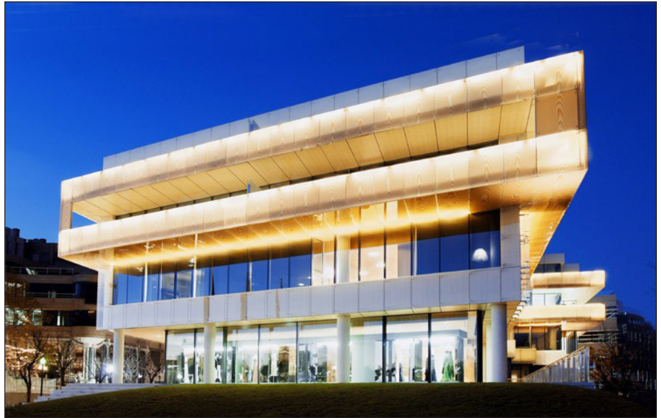
House of Sweden

Join members of the FCBA Broadband and International Committees on Thursday, December 1, 2011 from 6:00 – 8:30 p.m. at the Swedish Embassy, located at 2900 K Street, NW, Washington, DC 20007, for a Holiday Program and Networking Reception. Enjoy an evening event with special keynote speaker and a chance to network, while also enjoying an exhibit on Networked Society, a Swedish holiday smorgasbord, and traditional Scandinavian Santa Lucia procession. With its modern design, the House of Sweden adds a distinctively Scandinavian touch to the Georgetown Harbor and the waterfront. For directions and more