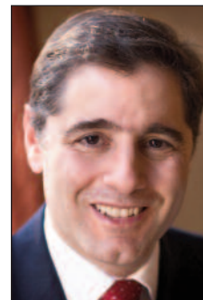
FCC Chairman Julius Genachowski

The 24th Annual FCC Chairman's Dinner will be held Thursday, December 9, 2010 at the Washington Hilton, 1919 Connecticut Avenue, NW. The evening will begin with a reception at 6:00 p.m. The dinner will begin at 7:30 p.m. in the International Ballroom and will be followed by remarks from FCC Chairman Julius Genachowski. Sponsor tables include a $350.00 tax deductible donation to the FCBA Foundation. Please use the registration form on page 22 to order tables or individual tickets.