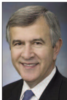
Senator Mike Johanns