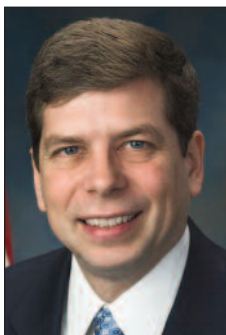
Senator Mark Begich