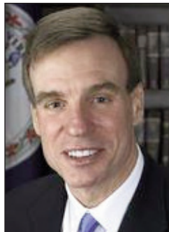
Senator Mark R. Warner

The FCBA will be holding a luncheon in conjunction with its annual meeting on Thursday, June 11, 2009 . The program will include announcement of the FCBA election results, a presentation of awards, as well as other orders of business, lunch and a keynote speech by Senator Mark R. Warner . The luncheon will be held at the Capital Hilton, 1001 16th Street, NW. Registration begins at 11:30 a.m. and the luncheon begins at Noon. To register, go to www.fcba.org or use the form on page 18.