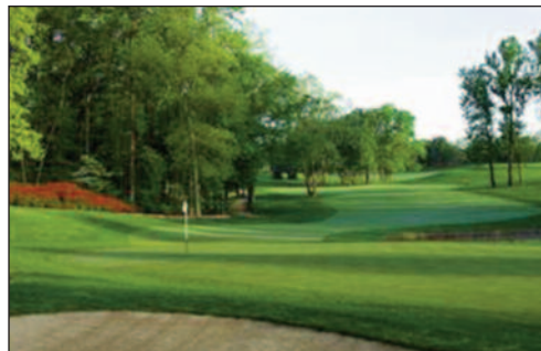
The Country Club at Woodmore

Sponsorships of the Spring Reception are available for $500 and $250 and include registrations to the reception. Sponsors will receive recognition in the newsletter and acknowledgement at the event. Individual tickets to the reception also, may be purchased. Please use the form on page 27 to register.