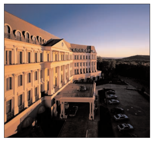
Nemacolin Woodlands Resort

Newsletter of the Federal Communications Bar Association