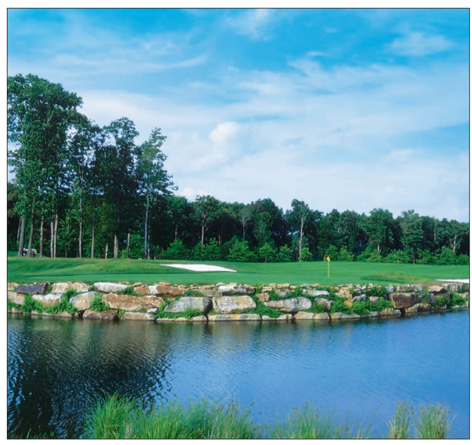
Mystic Rock Golf Course