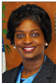
Commissioner Mignon Clyburn

The FCBA will be holding a luncheon on Thursday, March 8, 2012 featuring FCC Commissioner Mignon Clyburn. The luncheon will be held at the Capital Hilton, 1001 16th Street, NW. Registration begins at 11:30 a.m. and the luncheon begins at Noon. Please note that tables of 10 are available, although you cannot register online for this option; you must download the form and fax or email it in with attendee names. To register, click here or go to the FCBA Website – Calendar of Events or use the form on page 24 .