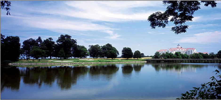
The River Marsh Golf Club