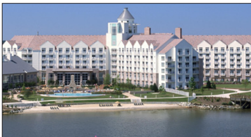
Hyatt Regency Chesapeake Bay Resort