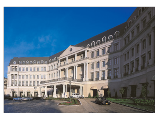
Nemacolin Woodlands Resort

The 2011 FCBA Annual Seminar returns to the Nemacolin Woodlands Resort, April 29 – May 1, 2011. Located in the Laurel Highlands of Southwestern Pennsylvania,