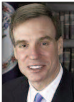
Senator Mark R. Warner

The FCBA will be holding a luncheon in conjunction with its annual meeting on Thursday, June 11, 2009 . The program will include announcement of the FCBA election results, a presentation of awards, as well as other orders of business, lunch and a keynote speech by Senator Mark R. Warner . The luncheon will be held at the Capital Hilton, 1001 16th Street, NW. Registration begins at 11:30 a.m. and the luncheon begins at Noon. To register, go to www.fcba.org or use the form on page 24.