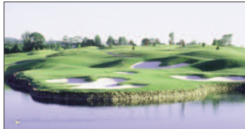
Worthington Manor Golf Club