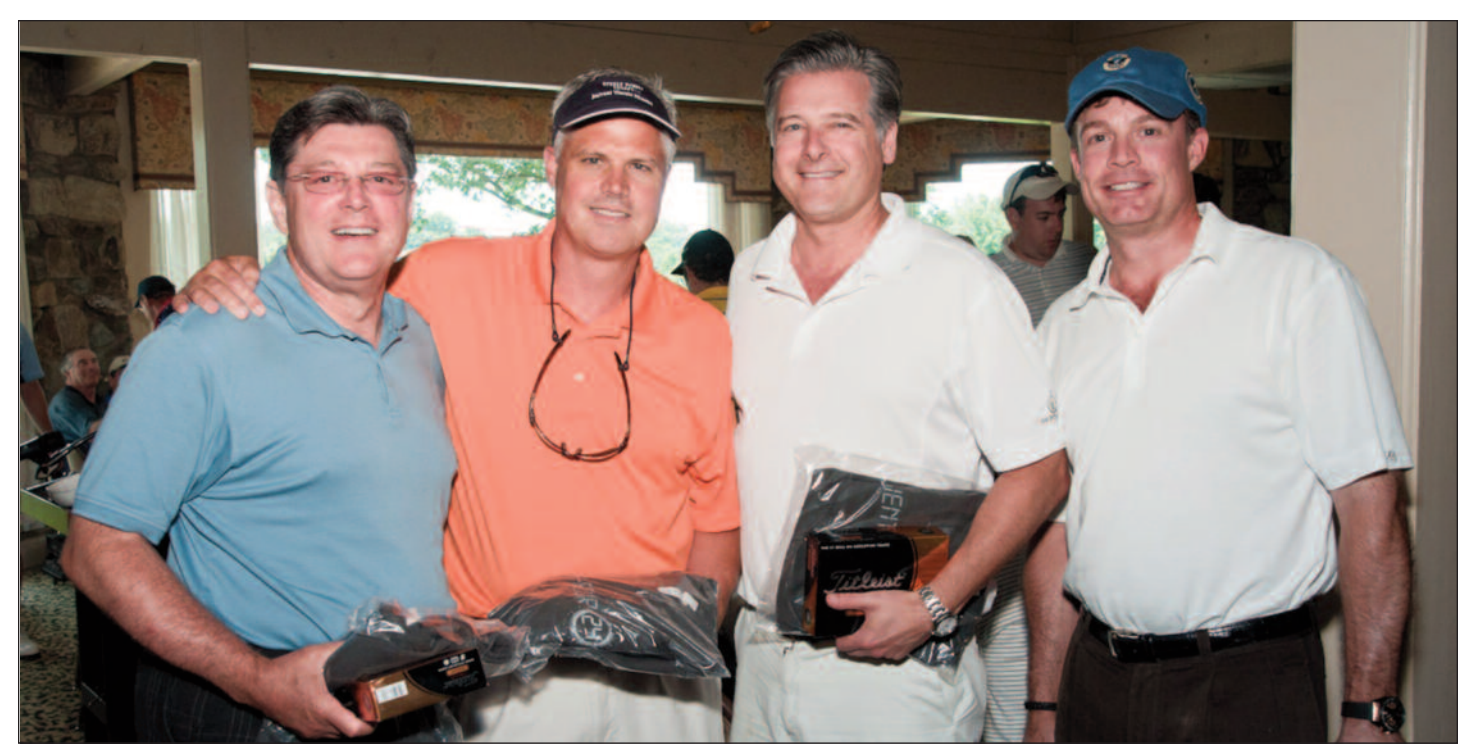
Eagle Trophy winners