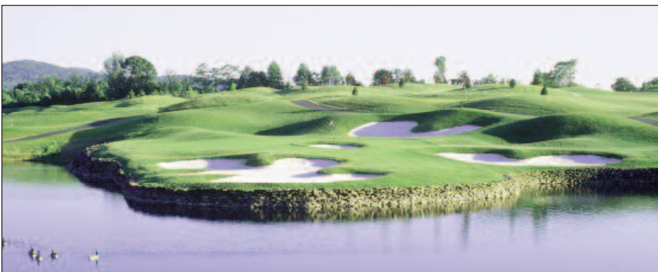
Worthington Manor Golf Club

NEW RULES FOR ADVOCATES UNDER THE RECOVERY ACT CHALLENGES AND ISSUES