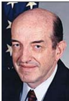
Michael J. Copps

The FCBA will be holding a luncheon on Tuesday, February 15, 2011 featuring FCC Commissioner Michael Copps. The luncheon will be held at the Capital Hilton Hotel, 1001 16th Street, NW. Registration begins at 11:30 a.m. and the luncheon begins at Noon. Please note that tables of 10 are available, although you cannot register online for this option; you must download the form and fax it in with attendee names. To register, click here or go to the FCBA Website – Calendar of Events or use the form on page 31 .