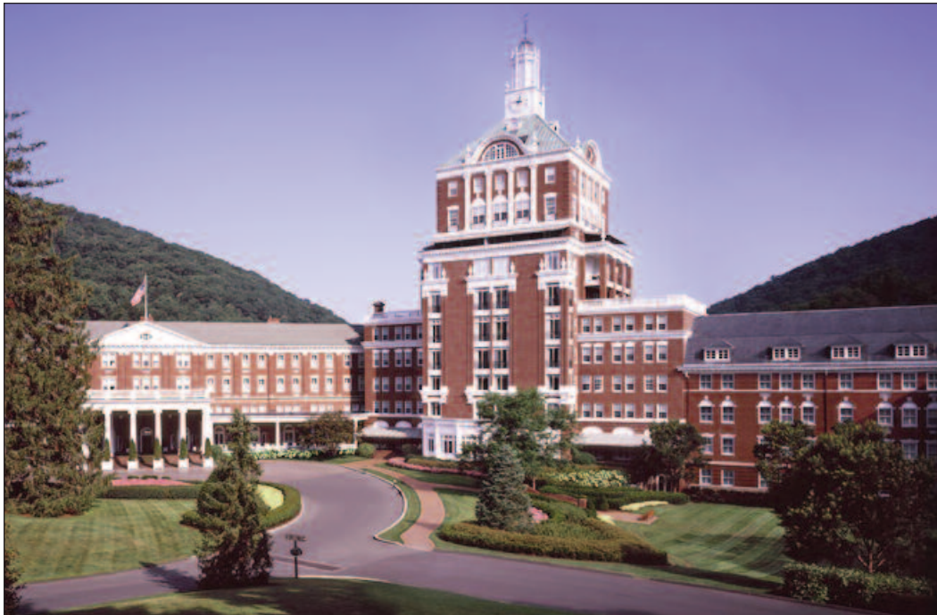
The Homestead in Hot Springs, Virginia

Newsletter of the Federal Communications Bar Association