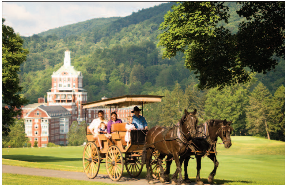
Carriage rides at The Homestead

Mark your calendars now and make plans to join your colleagues at The Homestead for the 2010 FCBA Annual Seminar. Watch for additional program details, the Resort reservation form, and