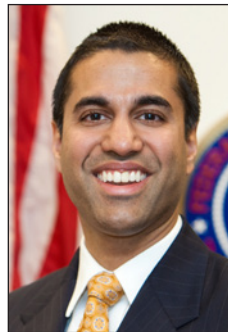
Commissioner Ajit Pai

The FCBA will be holding a luncheon on Thursday, February 21, 2013 featuring FCC Commissioner Ajit Pai. The luncheon will be held at the Mayflower Hotel, 1127 Connecticut Avenue, NW. Registration will begin at 11:30 a.m. and the luncheon will begin at Noon. Please note that tables of 10 are available, although you cannot register online for this option; you must download the form and fax or email it in with attendee names.