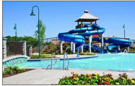
Pool complex at the Hotel Hershey

INFORMATION: The Hotel Hershey will only take room reservations by telephone. The toll-free reservation number is 1-800-533-3131. When making a reservation, please identify yourself as attending the FCBA Annual Seminar, group number 892947 . At