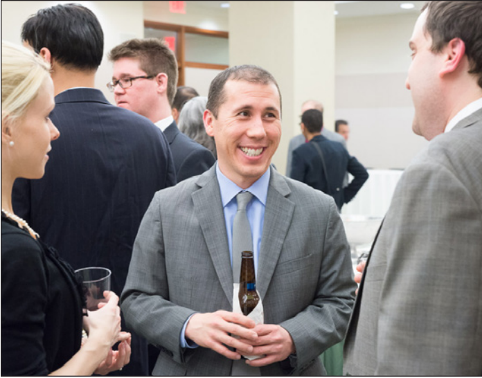
International Telecommunications Committee Reception