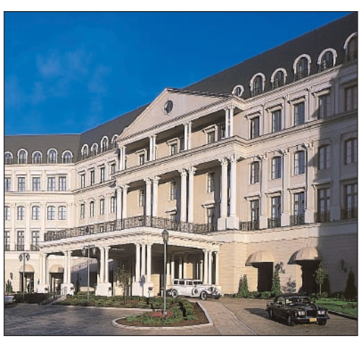
Nemacolin Woodlands Resort

Make your reservations early and win! As an incentive to make your reservations early, Nemacolin Woodlands Resort, this year's Annual Seminar locale, has offered to provide one single or double room at the CONTINUED ON PAGE 3