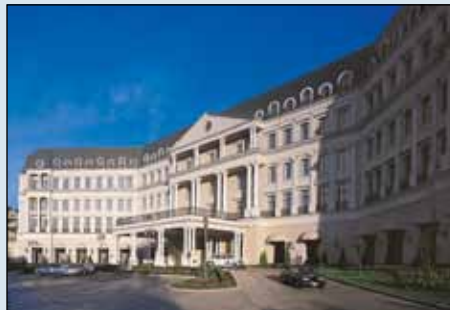
This year’s annual seminar will be held at the Nemacolin Woodlands Resort

To promote the goal of broad attendance and boost participation from public sector employees and academics, the FCBA is again offering Annual Seminar scholarships. Last year, the scholarship program was fully subscribed. An increase in attendance by the public sector and academics provides a unique networking opportunity and benefits all Annual Seminar attendees. The scholarship covers the registration fee (approximately $200), which includes meals, entertainment, and attendance at the seminar. Scholarship recipients will be responsible for all other costs of attending the Seminar, including travel and lodging expenses. A limited number of scholarships will be available on a first-come, first-served basis. Applicants are urged to apply early. The scholarship application can be found on page 31 of this month’s newsletter.