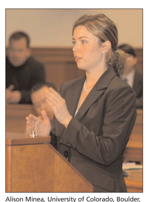
during semi-final round oral argument.