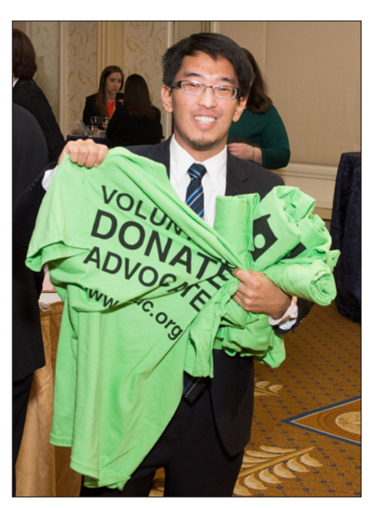
2012 FCBA Charity Auction

On Thursday, November 8, 2012, the Young Lawyers Committee and the FCBA Foundation hosted the 23rd Annual FCBA Charity Auction. Thanks to our very gracious donors, sponsors, and bidders, and the work of our many volunteers, we are excited to announce that the Auction raised nearly $115,000 to benefit THC—Housing Families, Transforming Lives and the FCBA Foundation. THC serves DC's homeless and other at-risk children and their families by providing housing and support services. These include rapid re-housing for recently homeless children and their families as well as transitional and permanent, supportive housing for families that have been homeless or living in shelters. THC will use proceeds from the Charity Auction to expand its housing and support services for the children and parents in its program. The FCBA Foundation will use its share of the proceeds to support its annual college scholarship program.