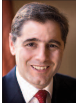
FCC Chairman Julius Genachowski

The 23rd Annual FCC Chairman's Dinner will be held Thursday, December 10, 2009 at the Washington Hilton, 1919 Connecticut Avenue, N.W. The evening will begin with a reception at 6:00 p.m. The dinner will begin at 7:30 p.m. in the International Ballroom and will be followed by remarks from FCC Chairman Julius Genachowski. There is still time to purchase tables and individual tickets for the dinner.