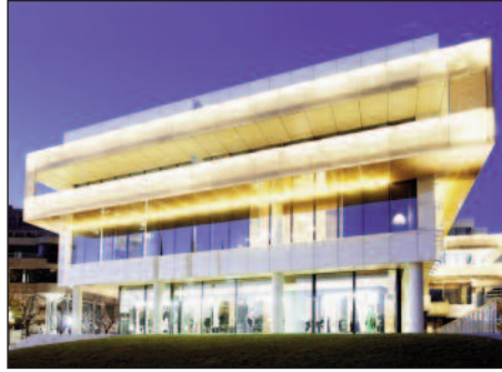
House of Sweden