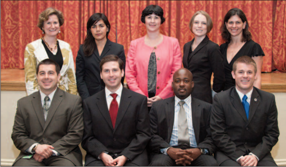
Foundation Internship Stipend Recipients and Co-Chairs