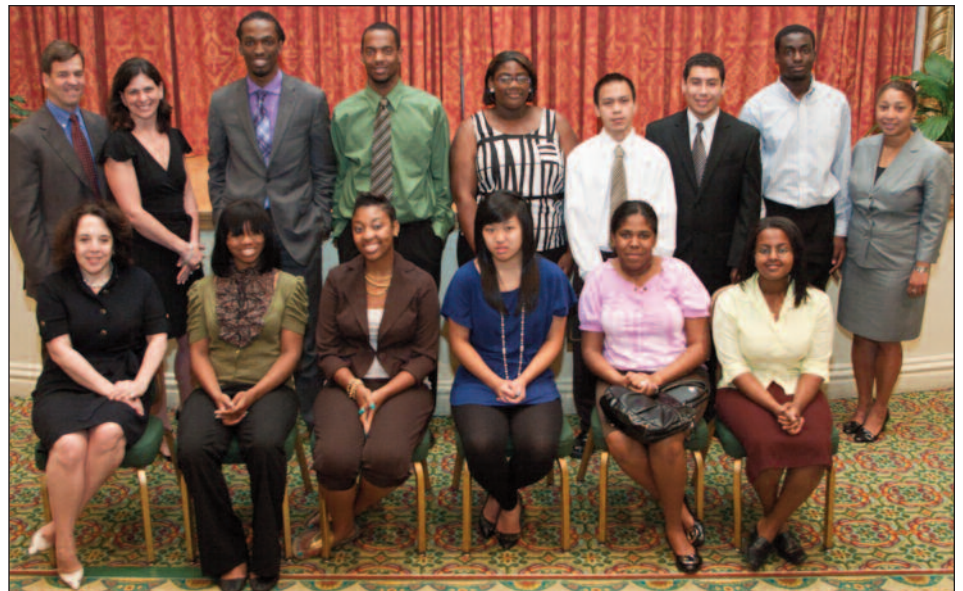
Foundation College Scholarship Recipients and Co-Chairs