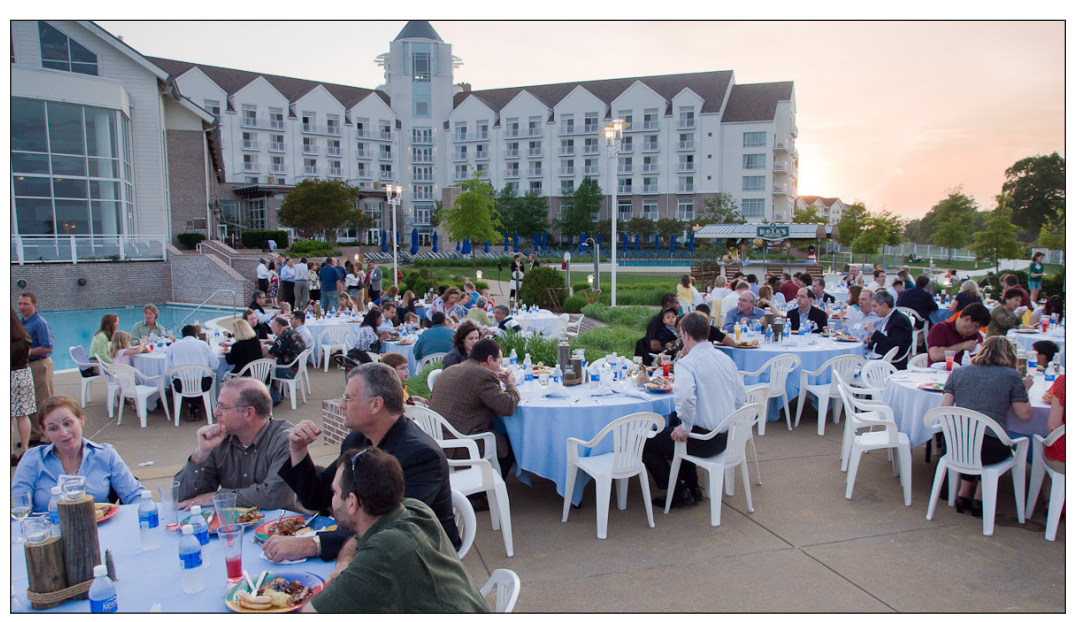
2008 FCBA Annual Seminar at the Hyatt Regency Chesapeake Bay Resort

Newsletter of the Federal Communications Bar Association