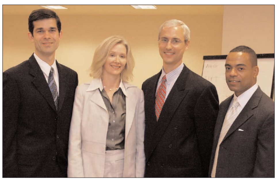
International Telecommunications Practice Committee