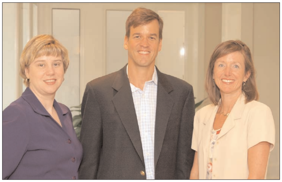
IP-Based Communications Practice Committee

We are interested in suggestions from FCBA members for future programming and welcome volunteers to help plan