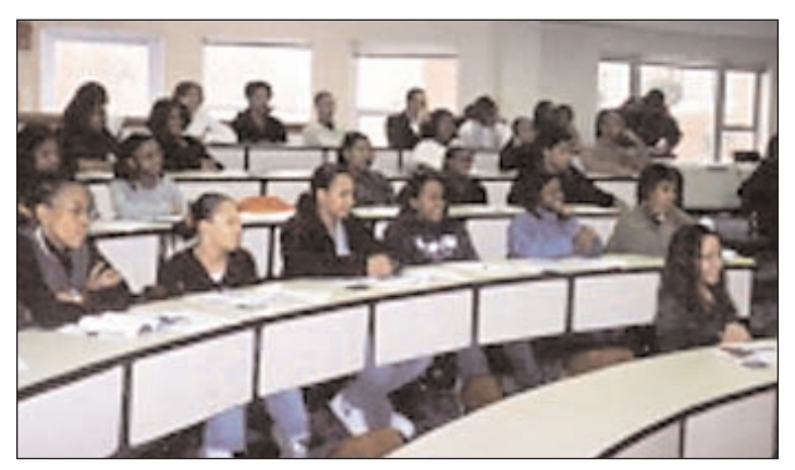
Howard University Law Students.