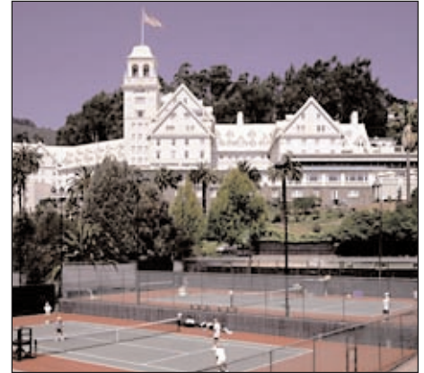
Seminar West is being held at the Claremont Resort and Spa in Berkeley, California.

With the front pages heralding new technologies, and federal regulatory responses, daily states' roles in shaping the regulatory landscape for future technologies is sometimes overshadowed. Yet, several important