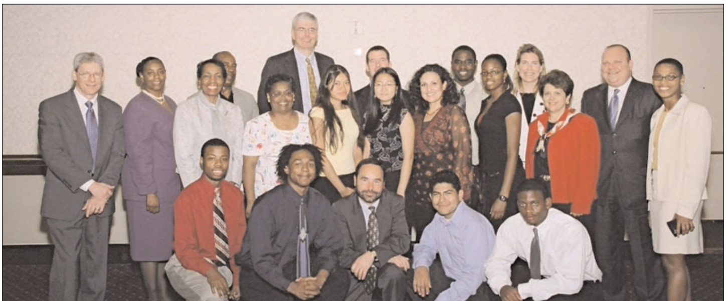
2004 Scholarship Winners, with teachers and Foundation Trustees.