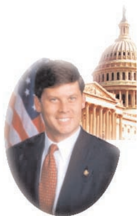
Congressman Charles "Chip" Pickering