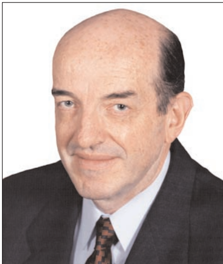
FCC Commissioner Michael Copps