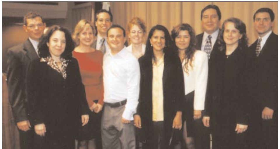
Members of the Charity Auction Planning Committee with SED Board Members.