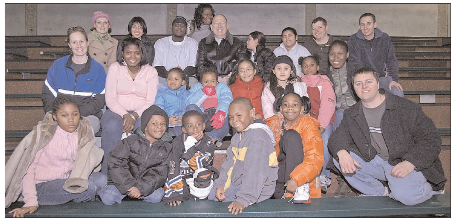
FCBA Volunteers and Martha's Table children and chaperones at the Ft. Dupont Skating Arena.