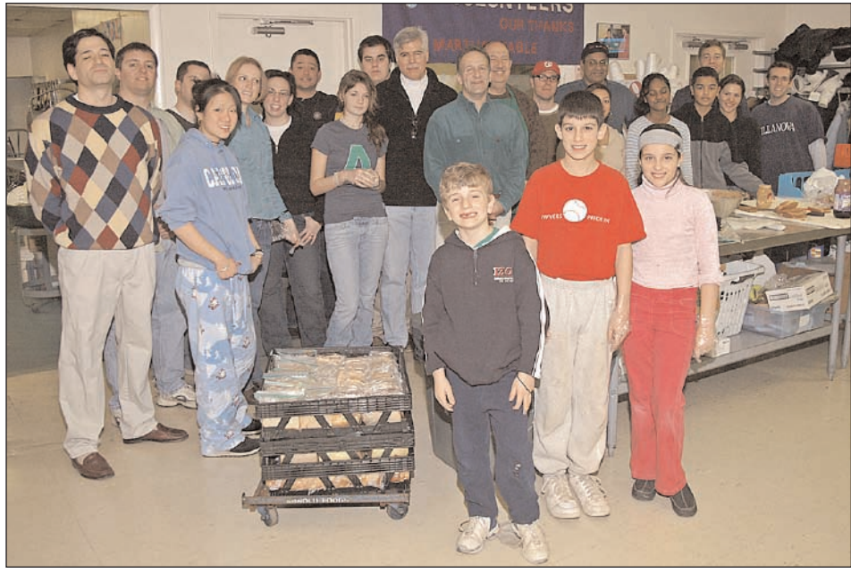
Cable Practice Committee's first shift