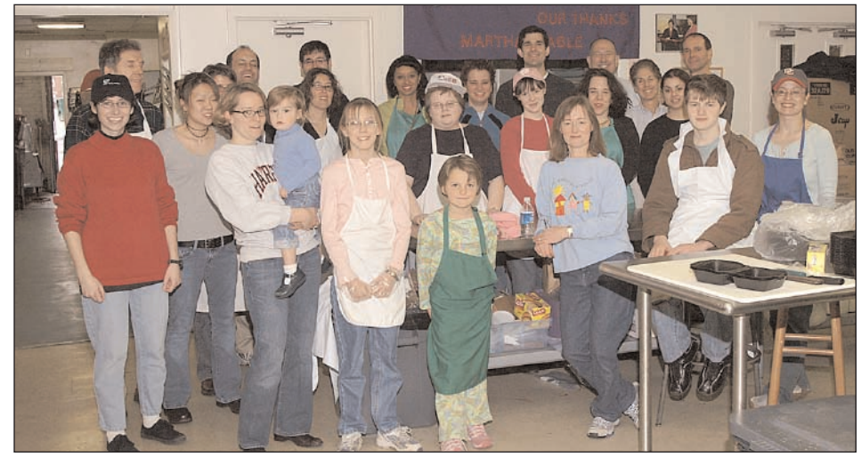
International Practice Committee participants

In addition to helping with the scholarship program, throughout the year the Foundation sponsors other events and opportunities for volunteers. Last month volunteers accompanied children from Martha's Table's Children