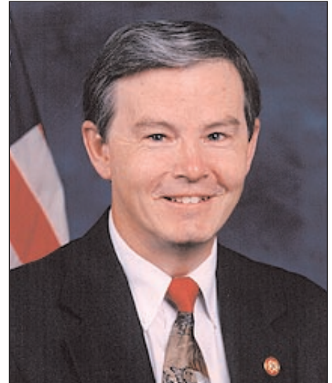
Congressman Joe Barton