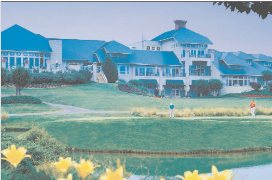
The Kingsmill Resort in Williamsburg, VA.