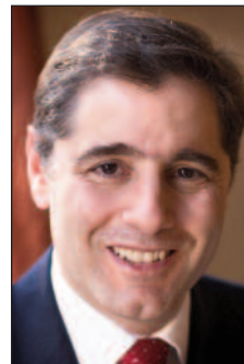
FCC Chairman Julius Genachowski

The 24th Annual FCC Chairman's Dinner will be held Thursday, December 9, 2010 at the Washington Hilton, 1919 Connecticut Avenue, NW. The evening will begin with a reception at 6:00 p.m. The dinner will begin at 7:30 p.m. in the International Ballroom and will be followed by remarks from FCC Chairman Julius Genachowski. Sponsor tables include a $350.00 tax