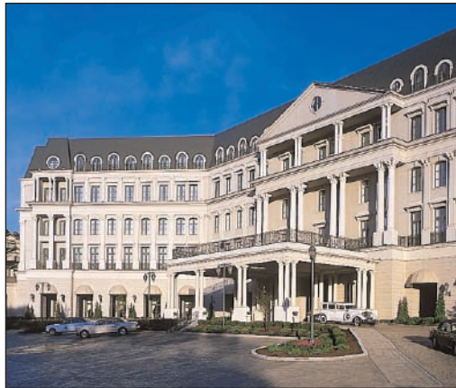
Nemaconlin Woodlands Resort

The Annual Seminar will, as always, feature a variety of programming and a range of activities for industry professionals and their families and guests.