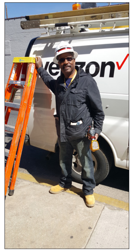
Out in the field serving customers

ANNIVERSARY RECEPTION CONTINUED FROM PAGE 1