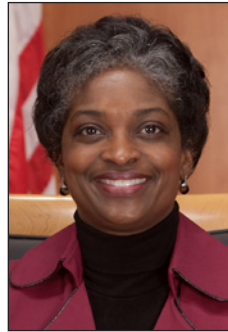
FCC Acting Chairwoman Clyburn

The FCBA will be holding a luncheon on Tuesday, September 24, 2013 featuring FCC Acting Chairwoman Mignon Clyburn. The luncheon will be held at the Grand Hyatt Hotel, 1000 H Street, NW. Registration will begin at 11:30 a.m. and the luncheon will begin at Noon. Please note that tables of 10 are available, although you cannot register online for this option; you must download the form and fax or email it in with attendee names.