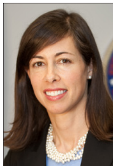
FCC Commissioner Rosenworcel

The FCBA will be holding a luncheon on Tuesday, October 29, 2013 featuring FCC Commissioner Jessica Rosenworcel. The luncheon will be held at the Capital Hilton, 1001 16th Street, NW. Registration will begin at 11:30 a.m. and the luncheon will begin at Noon. Please note that tables of 10 are available, although you cannot register online for this option; you must download the form and fax or email it in with attendee names.