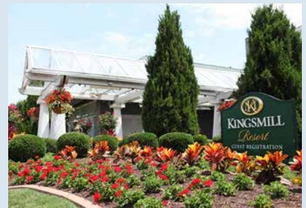
Kingsmill Resort in Williamsburg, VA

Mark your calendars now and make plans to join your colleagues at Kingsmill Resort in Williamsburg, VA for the FCBA Annual Seminar on April 28-30, 2023. Watch for program details in the coming months.